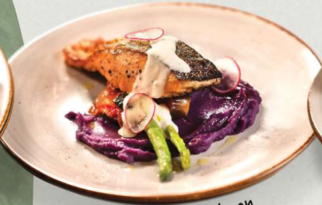
Pan Fried Salmon