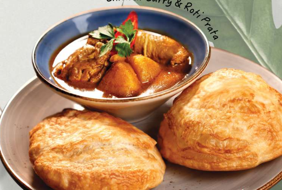
Chicken Curry & Roti Prata